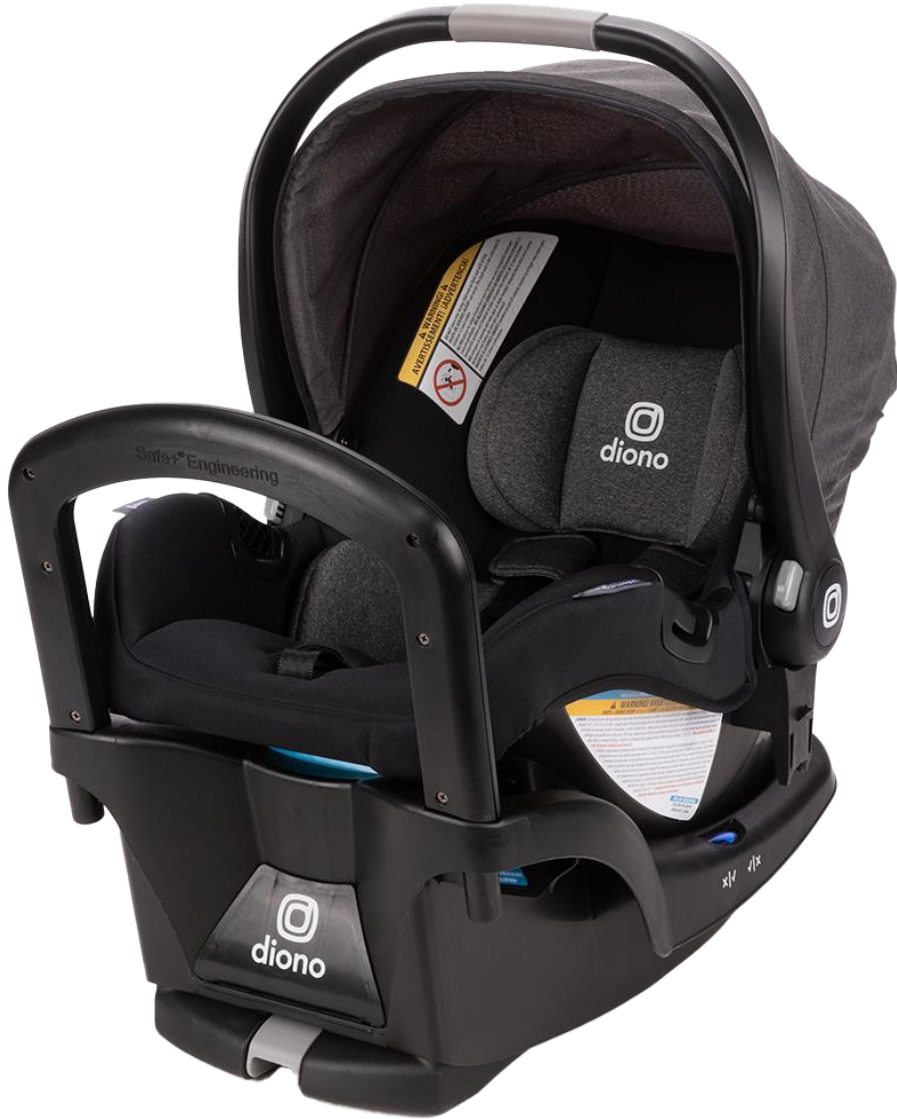
LiteClik®30 R SafePlus®